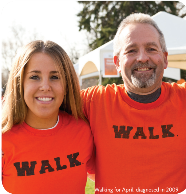
Walking for April, diagnosed in 2009